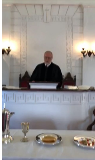
Palm Sunday 2020