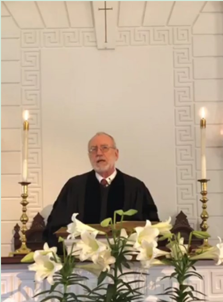
Easter Sunday Worship Service

Facebook Live Worship Every Sunday 10:25 am