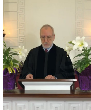
Easter Sunday 2020