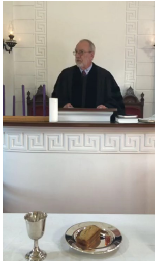
Tenebrae Service 2020