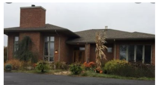
Wind Flower Farm