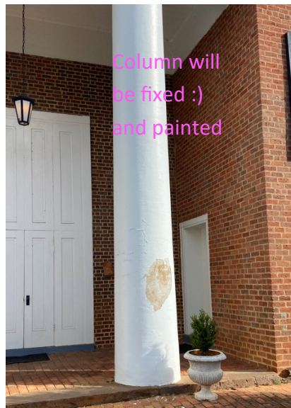
Column will be fixed :) and painted