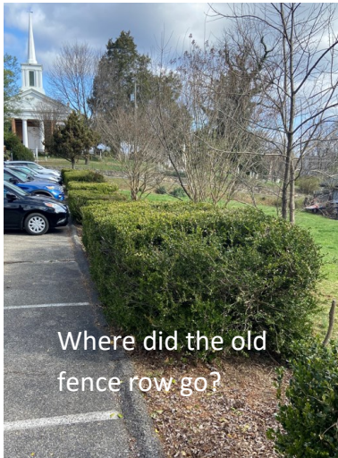
Where did the old fence row go?