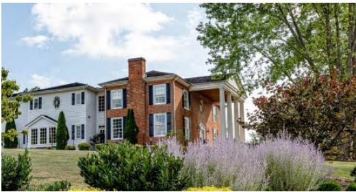
The Reynolds Home