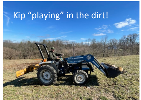
Kip “playing” in the dirt!

The Property Committee has focused on three areas of the church: The back lot (smoothing out after the “trash trees” were burned and buried), the parking lot in the front (removing an old fence and spreading mulch) and the entrance of the church (painting the stairs to the balcony and repairing and painting the columns). Thanks to all for the facelift.