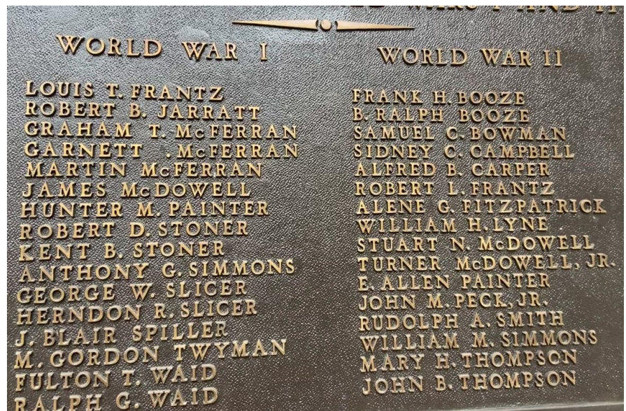
Views from plaques on the front and east side of the church.