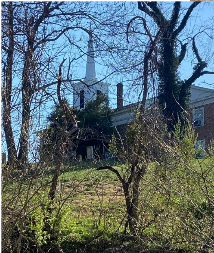
This is a picture of the walk way from the Big Spring Park to Breckinridge Elementary School. It is a great walk!