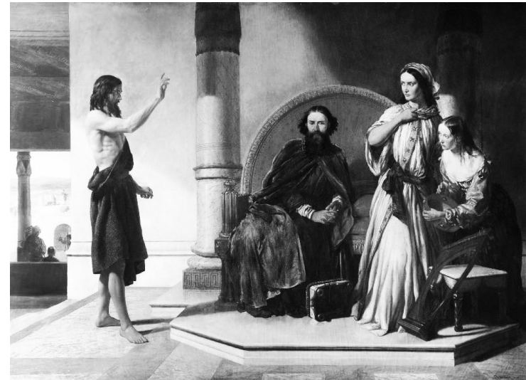
The title of this art work is "John the Baptist Reproving Herod" It is by the artist John Rogers Herbert (1810-1890).