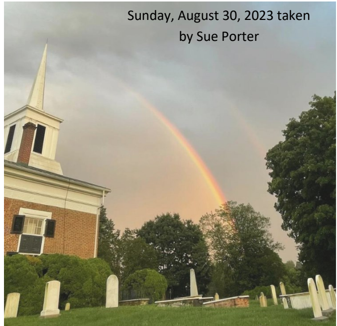
Sunday, August 30, 2023