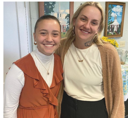
Congratulations to the Winners of the Suzanne Moore Hale Scholarship given by FPC