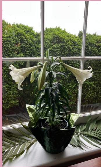
Easter Sunday Service